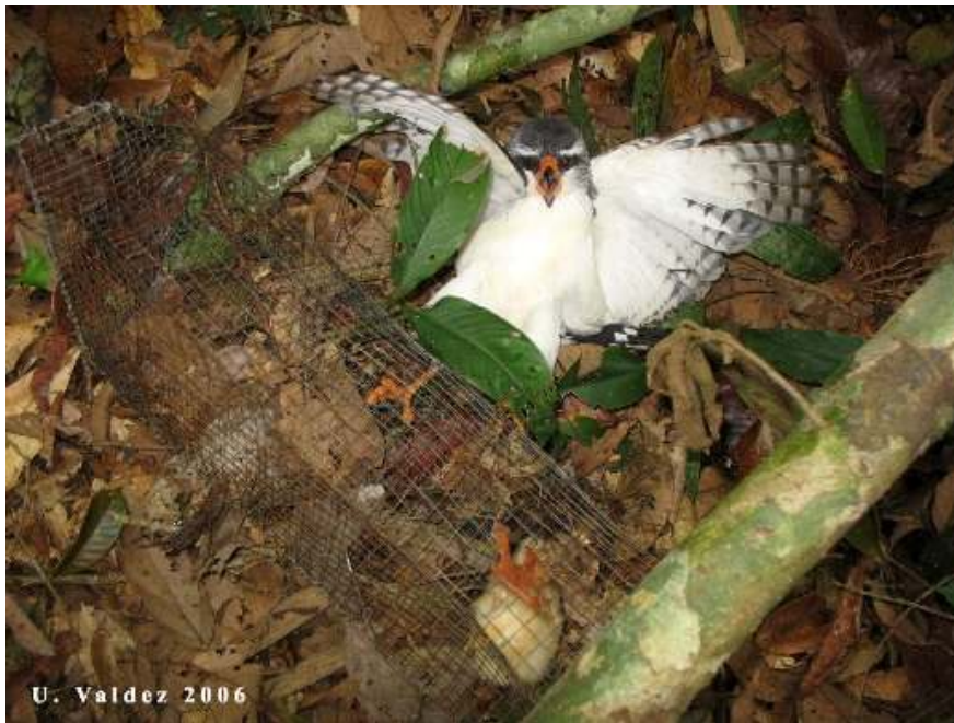
U. Valdez 2006

Large species such as the Harpy Eagle ( Harpia harpyja ), Crested Eagle ( Morphnus guianensis ), Black-and-white Hawk-eagle ( Spizastur melano-leucus ), Ornate Hawk-eagle ( Spizaetus ornatus ) and Black Hawk-eagle ( Spizaetus tyrannus ) have been recorded in lowlands of Manu Na-