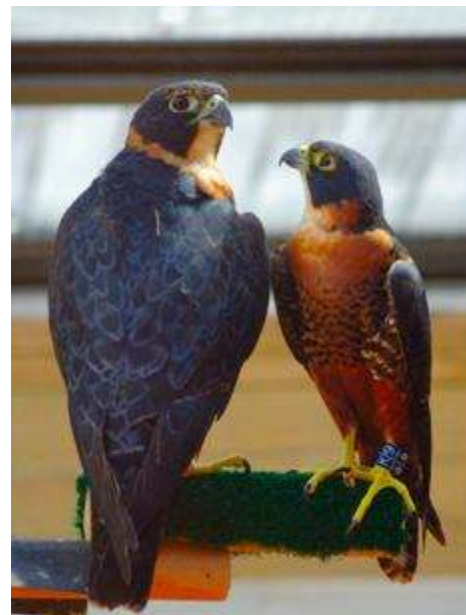
Pair at the breeding facility in Wyoming

These beautiful, medium-sized falcons once resided in tropical forests from southeastern Mexico through Central America to Peru, Bolivia, Paraguay and northern Argentina. Orange-breasted Falcons may be one of the most sparsely distributed falcons in the world. They feed on smaller birds and bats, pursuing them at high speeds and catching them in the air. The falcons generally nest on precipitous cliffs like the Peregrine Falcon and occasionally in emergent trees. The Orange-breasted Falcon has a white