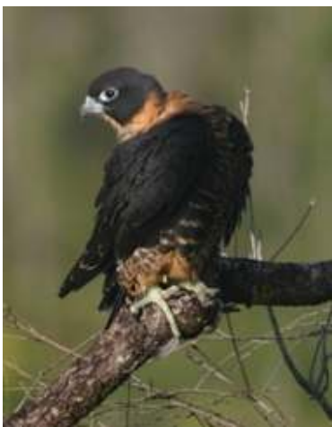
Chick in Belize