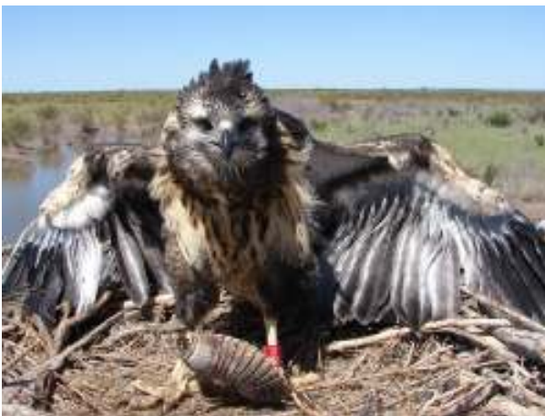
Crowned Solitary Eagle ( Harpyhaliaetus coronatus ) banded fledgling at a nest in Prosopis caldenia tree ( Prosopis caldenia ).

The Crowned Solitary Eagle ( Harpyhaliaetus coronatus ) is considered endangered, although its conservation status is still unknown. Researchers point to habitat loss and direct persecution by humans as the most serious threat to the population but none of them has been thoroughly investigated. One of the main factors that limit the analysis of these causes is the limited knowl-